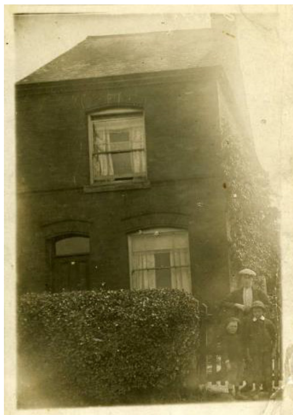
Figure 33 123 Sketchley Road, Burbage