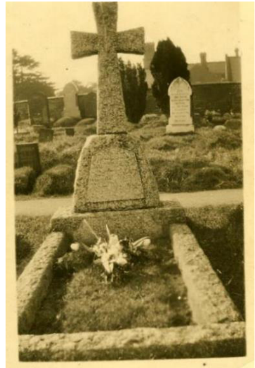
Figure 43 St Catherine's Churchyard